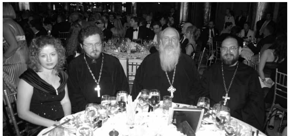
Building new alliances. Days of Russia: the power of trust.